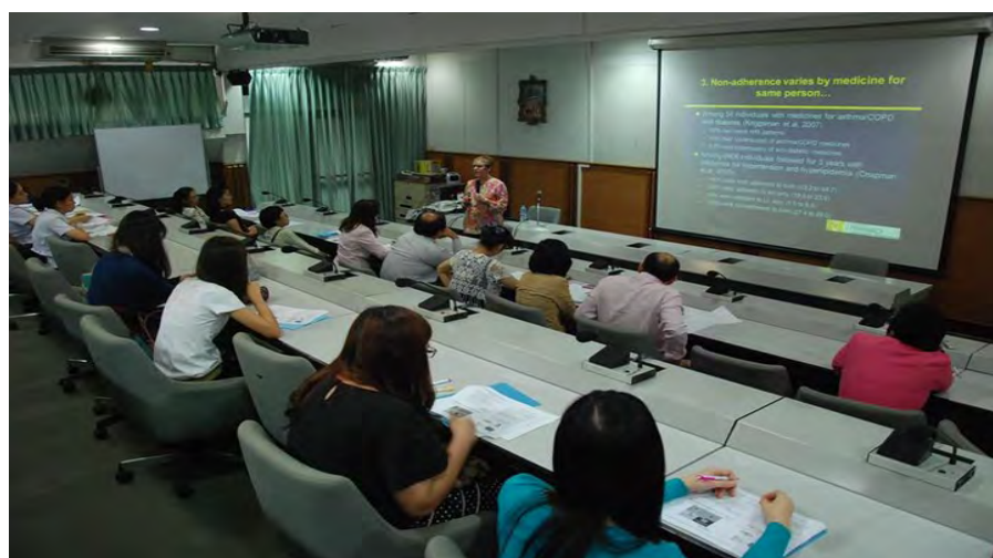
In class and online e-learning mode of learning

Pharmaceutical Sciences is also first and famous faculty in nation. Ranked 101st-150th in Asian-QS University Rankings, 2013.